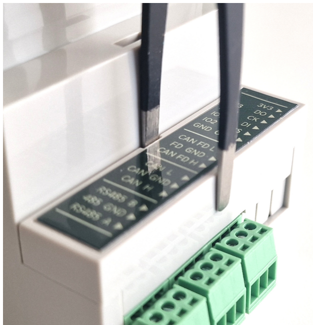
Figure 3: Opening the connector covers